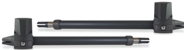
LEADER TI Pair of swing motors and fittings