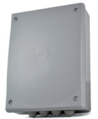
Q80A/Q20A Control board integrated with plug-in radio receiver 433.92