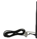
ANT02 Aerial 433,92 Mhz